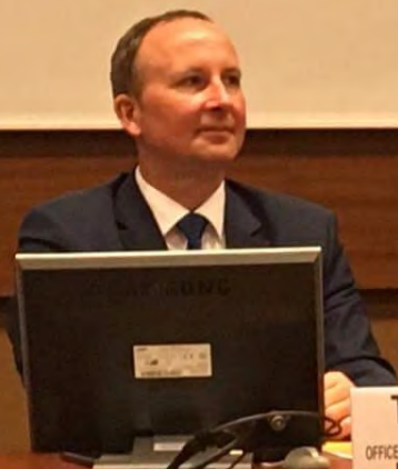
T. SLAPNIK STATE SECRETARY OFFICE OF THE PRIME MINISTER OF SLOVENIA